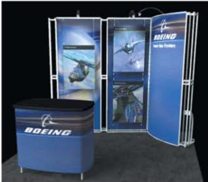
Portions of your larger exhibit can be used for smaller regional shows.