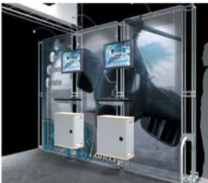
Flat screen mounts, keyboard shelves and storage units create effective kiosks.