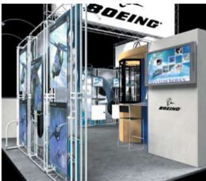
Inliten integrates with Engage panel system to create conference or storage rooms.