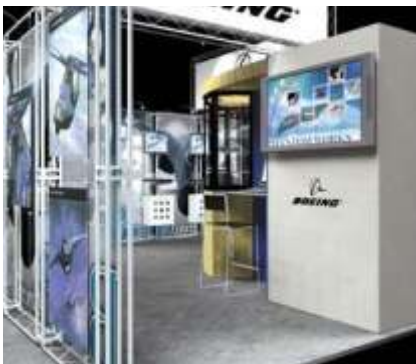
Inliten integrates with ps3000 panel system to create conference or storage rooms.