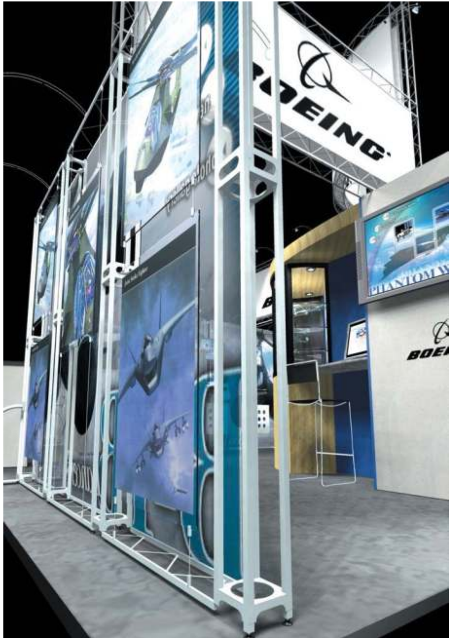
Inliten works as part of a complete exhibit solution. It can carry graphics on both sides of its frame section which eliminates redundant structure and reduces costs.

Inliten patents: DM/060 461 ... D471,726 ... D472,719 ... 6,615,562 ... D482,204 ... D482,877 ... 6,659,159 ... D485,995 ... 6,712,229 ... D496,798 ... DE10297217T5 ... DE10297216T5 ... DE10297215T5 ... DE10297211T5 ... D497,498 ... D493,290