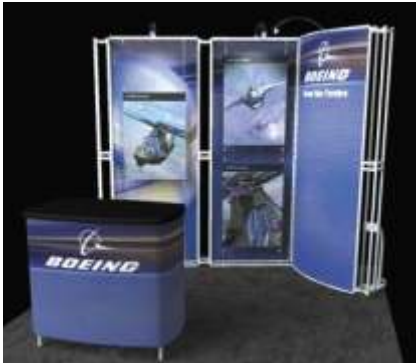
Portions of your larger exhibit can be used for smaller regional shows.