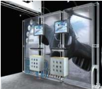
Flat screen mounts, keyboard shelves and storage units create effective kiosks.